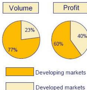
BAT's exposure to developing markets