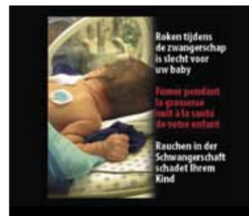
Warning label, Belgium

The FCTC, the world's first global public health treaty, establishes a policy framework for reducing the devastating health and economic impacts of tobacco. Article 11 of the FCTC requires Parties to implement effective measures to warn against the harmful impact of tobacco use on all tobacco product packaging within three years after ratification. Implementation of a pictorial warning label policy presents no financial cost to governments; fees are borne by tobacco companies.