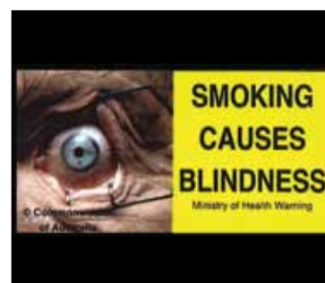
Warning label, New Zealand