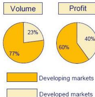
BAT's exposure to developing markets