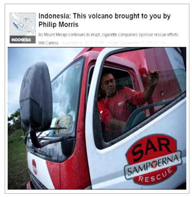
Photo from Global Post article on Sampoerna rescue activities in Indonesia.33