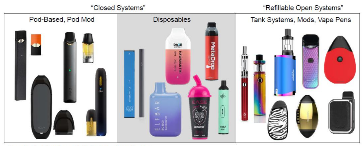
Sample of e-cigarette products. Images are not to scale.

The term "electronic cigarettes" covers a wide variety of products now on the market, from those that look like cigarettes, pens or USB drives to somewhat larger products like "personal vaporizers" and "tank systems." Instead of burning tobacco, e-cigarettes most often use a battery-powered coil to turn a liquid solution into an aerosol that is inhaled by the user. The design of e-cigarette devices have changed since they have been introduced, becoming more sleek and more concealable.